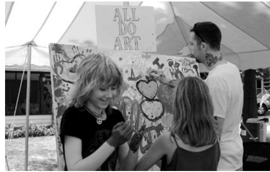
Do Art participants paint a community canvas, and themselves!

Do Art provided a free opportunity for all ages, 4 to 104, to learn and do all kinds of art with professional artists. Muddy Creek Artists Guild and the Museum partnered to offer this event for the second year. Thank you Muddy Creek Artists Guild for a job well done! Do Art had a twenty percent increase in participation this year, and there was a good mix of children and adults—DOING ART.