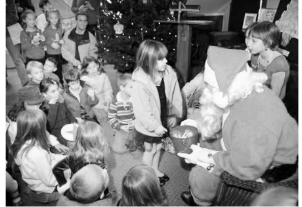
Santa visits with children at last year's tree-trimming event.

Ornaments for the tree were hand crafted by students from the Lula G. Scott Early Head Start program and local Girl Scout Troop 4603.